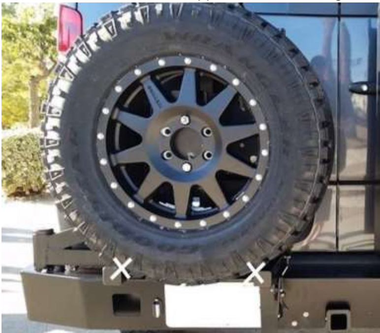
Figure 1. Rest tire on both support arms (before tightening the lugs or U-bolts down).

15. When installing your tire to the tire rack swing arm (if applicable), be sure to place the tire so that it rests on the two support arms before tightening anything down ( see Figure 1 )