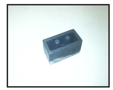
BL303 / Qty (2) Rear lifted block