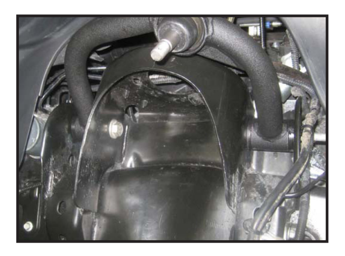
21. Locate (6) 3/8" nylon nuts and (6) 5/16" USS flat washers from hardware bag D2P-NB. Working on the driver side, install the newly modified strut into the upper location and secure using the new hardware. Do not tighten at this point. Repeat procedure on the passenger side.