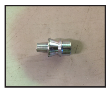
S10259 / Qty (2)