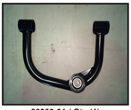
20930-01 / Qty (1) Driver side Upper Control Arm