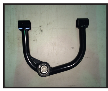
20930-02 / Qty (1) Pass. side Upper Control Arm