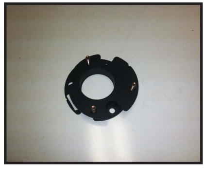
23000-04 / Qty (1) Passenger side Strut Spacer