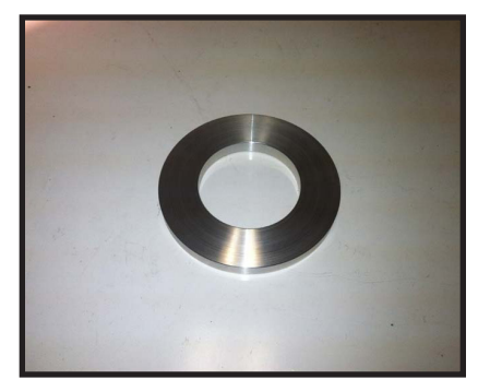
23000-05 / Qty (2) Pre-Load Spacer