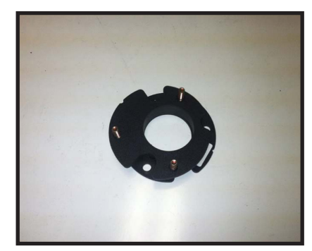
23000-03 / Qty (1) Driver side Strut Spacer