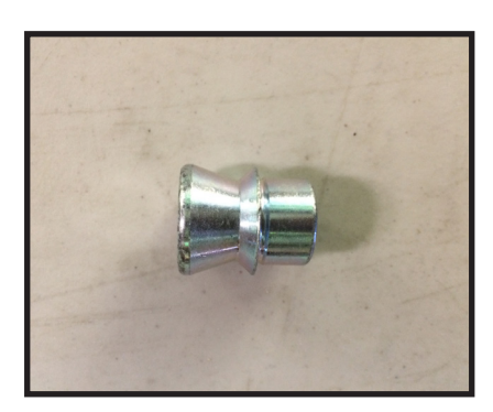
S10246 / Qty (2)