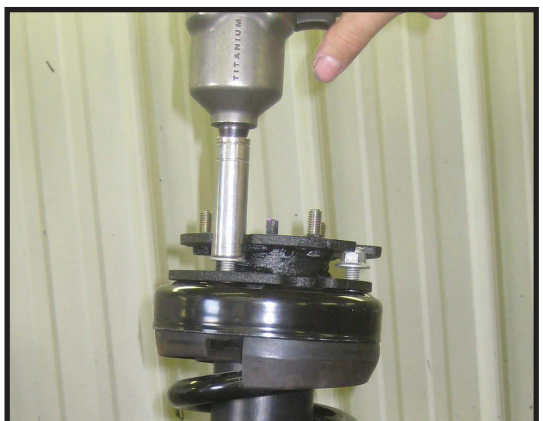
17. Repeat steps # 11 - 16 on the passenger side strut.

18. Locate the new upper control arms. Locate (8) TC-002 poly bushings and (4) S10236 sleeves from hardware bag 23005NB. Install the new bushings and sleeves into the new upper control arms. Special note: Make sure to use a fair amount of lithium or moly base grease before installing the new bushings and sleeves into the control arms. This will increase the life of the bushing as well as help prevent squeaking.