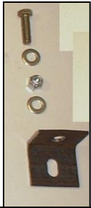
Angle bracket & bolts used on 1500 series only