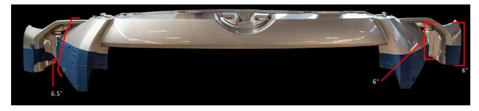
Side Trim Piece

When finished cutting, it should look as shown.