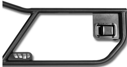
(Fig 2. 90773 JK Door - Handle Plate Orientation)