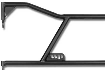
(Fig. 1 WP Plate Orientation - All Doors - 90772 shown)

Important: Before starting your installation, determine which door is the driver side and which door is passenger side. You can identify this by the stenciled 'WP' logo plate that should correctly read from the outside of the vehicle. 'W' on the left, 'P' on the right. Additionally, the JKs paddle handle mounting plate is welded to the interior side of the tubes, so when you look at the door from the outside of the vehicle the tubing of the door is positioned in front of the paddle handle mounting plate. These images show the orientation of the WP plate and the JKs paddle handle mounting plate.