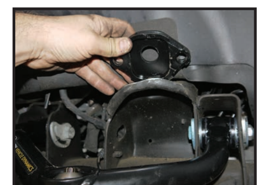
9 . Install the supplied (174037) stem top adapter on top of the shock bucket, taking care to note that the middle hole is offset to bring the shock outward for clearance. Using the supplied 9/16" hardware, fasten the adapter mount using a 13/16" wrench and 7/8" socket. [FIGURE 6 & 7]