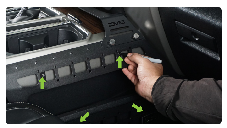
STEP 3 Using a 11/32 drill bit, drill the (4) mounting holes on each side.