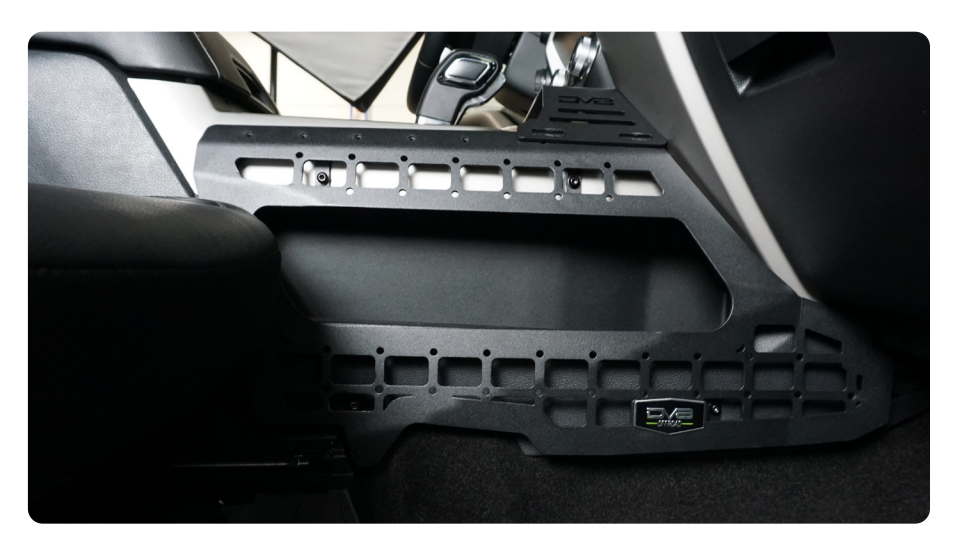
STEP 6 Using the (4) Locking Knobs, secure the Bridge piece to the side panels.