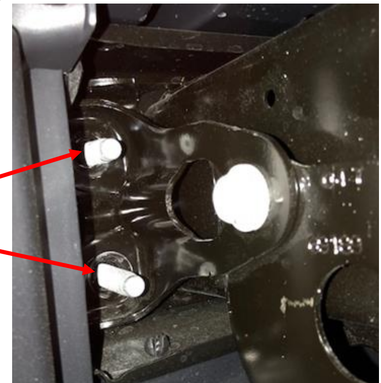
Figure 2: Back side of bumper

☐ C) Remove (8) nuts from bumper studs using 18mm socket. Retain for later use.