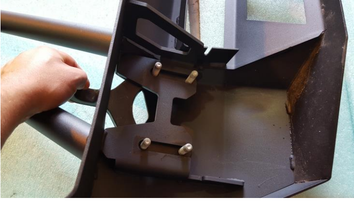
Figure 4: Installing OEM tow hooks