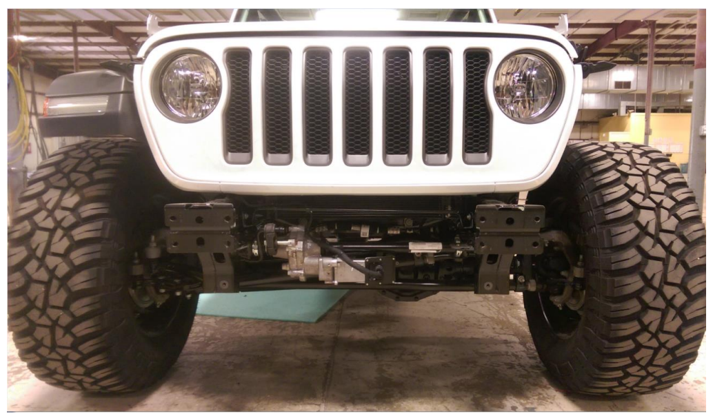
Figure 3: Bumper removed

☐ H) Using Torx bits, remove the shroud and tow hooks from the factory bumper. The tow hooks will be reused in the Vengeance bumper.