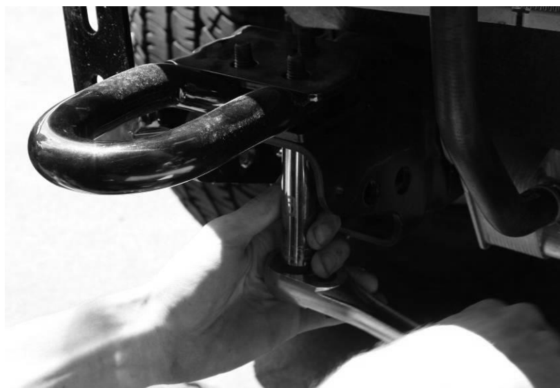
Figure 3 - Tow Hook Removal

7. Remove the bumper mount / tow hook assembly from both frame rails using a 15mm socket. Save this hardware for later use.