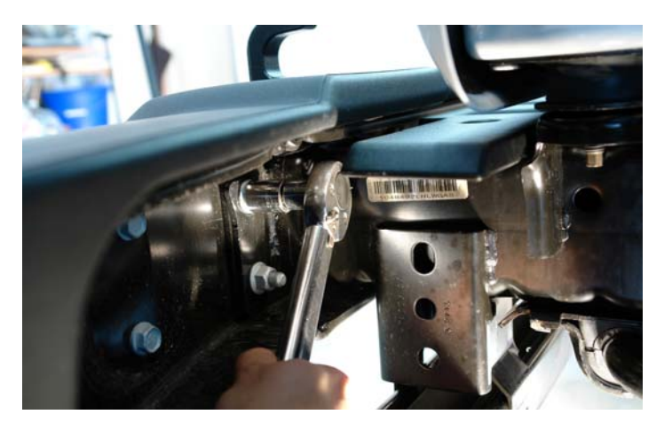
8. Remove the backing plates off the bumper mounting studs as shown in this photo.

7. Using an 18mm socket, remove the 4 bumper mounting nuts (2 on each side) located next to the outside of your Jeep JK Wrangler's frame rails.