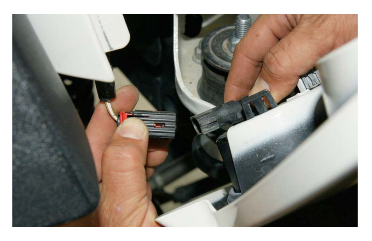
27. Plug your Jeep JK Wrangler's factory wiring harness into the fog lights.

26. Squeeze the wiring harness plug and pull it out of your Jeep JK Wrangler's indicator light socket. You can now pull the grille off and set it aside for now.