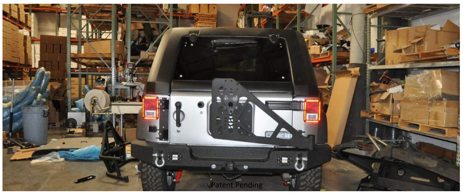
Estimated install time - Approx. 30min -1 hour. Difficulty Level: EASY